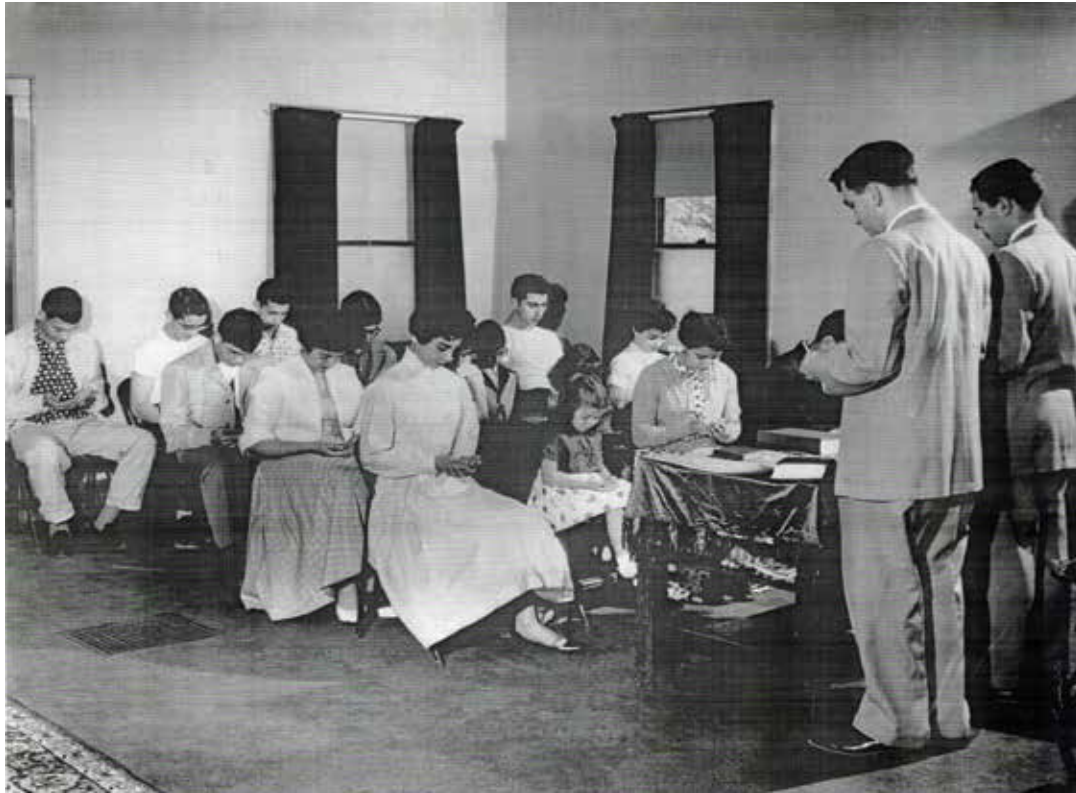
A children's class at the Moslem Temple of Cedar Rapids, Iowa, circa 1945. Their cupped hands and bowed heads suggest that they are reciting a prayer, most likely the first chapter of the Qur'an, al-Fatiha .